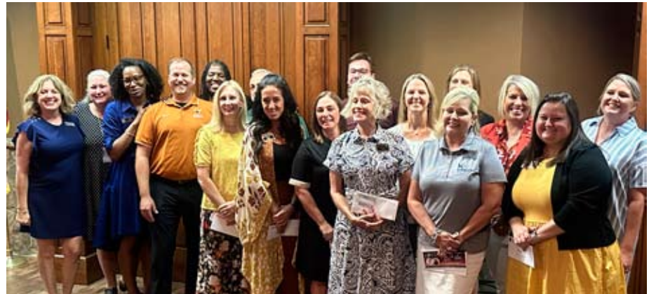
TEACHERS AND PRINCIPALS REPRESENTING COBB COUNTY SCHOOLS CHRISTMAS IN AUGUST - FOR OUR LOCAL SCHOOLS

It was Christmas in August for 17 North East Cobb Schools plus KMHS and 13 Marietta Schools as Piedmont Church distributed $36,000 raised by the Egg Drop held at Sprayberry High School and the church's Love Does Program. The monies are used for high school Shop with the Kids programs at Christmas, Football sponsorships for Marietta, Kell, Sprayberry and Kennesaw Mountain High School plus a variety of programs that benefit the elementary and middle schools in NE Cobb and the City of Marietta. Representatives from these schools gathered for a luncheon on Monday August 14 at Piedmont Church where the checks were presented.