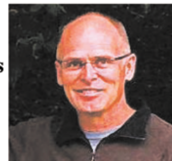
Licensed & Insured