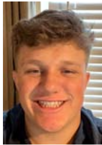
BLAKE ELLSWORTH THE MARLON LONGACRE HEART OF A CHAMPION SCHOLARSHIP