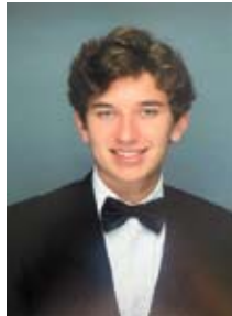
HARRISON BULLARD WALLY ZIMMERMAN VOCATIONAL, ENGINEERING, AND COMPUTER SCIENCE SCHOLARSHIP