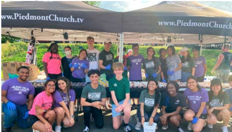
Piedmont Church had a ton of helpers from KMHS last year. The Church won two trophies People's Choice and Reserve Champion in Lord of the Wings last year.

Saturday features our PEOPLES' CHOICE PORK contest. Cook teams compete with their pulled pork and patrons vote with their gold tickets for their favorite pork. The cook teams also compete on chicken and ribs with judges from the Georgia Barbeque Association (GBA). Patrons purchase Taster Tickets from friendly North Cobb Rotarians.