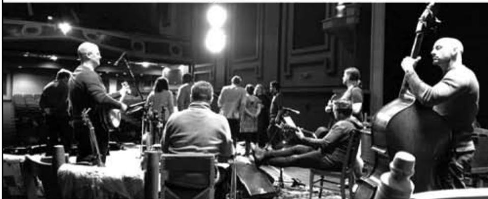
Strand Ole Opry's Walk The Line SATURDAY, JULY 31 @ 8:00pm