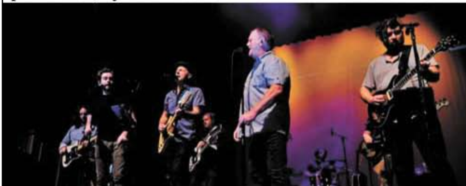
Georgia Players Guild Presents: The Music of the Eagles SATURDAY, JULY 17 @ 8:00pm

We are absolutely over the moon. Pumped. Jazzed. Bouncing off the walls. Because WE'RE BACK. We missed you. We missed your faces. We missed those of you that are first to arrive, the last to leave, and everyone in between. We've got a WHOLE LOT of stuff planned for July. Take a look below for what's on deck this month.