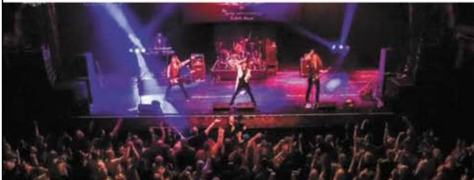
DEPARTURE: The Journey Tribute Band FRIDAY, JULY 30 @ 8:00pm