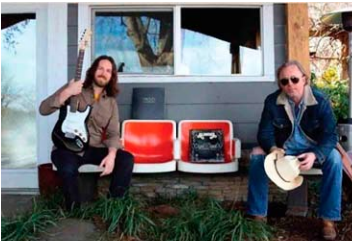
THE GEORGIA PLAYERS GUILD TRIBUTE TO THREE DOG NIGHT AND HALL & OATES ON FRIDAY, MAY 7TH - 8:00 P.M.