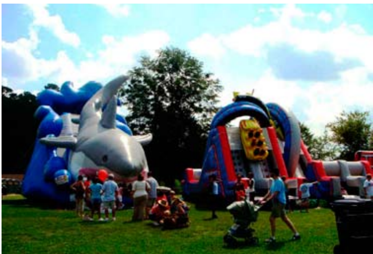
CHILDREN ENJOY THE LARGE KID'S ZONE FILLED WITH INTERACTIVE INFLATABLES.