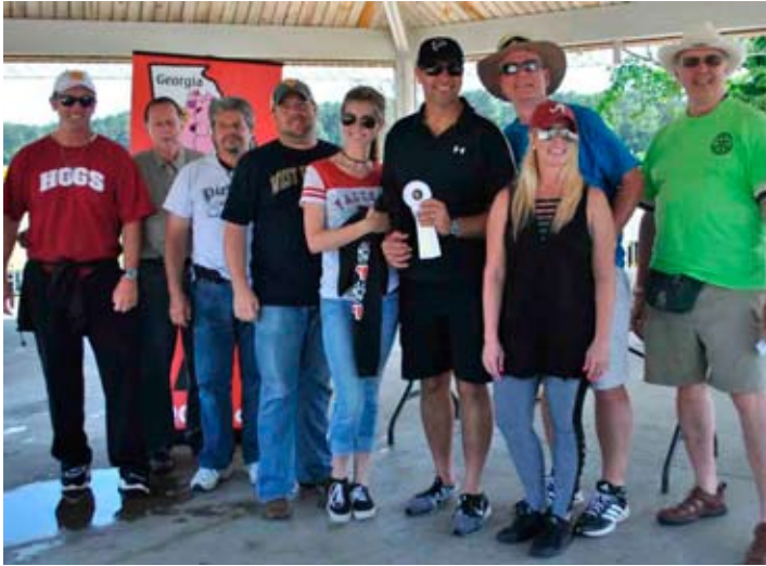
SMOKE ON THE LAKE PEOPLE'S CHOICE WINNER