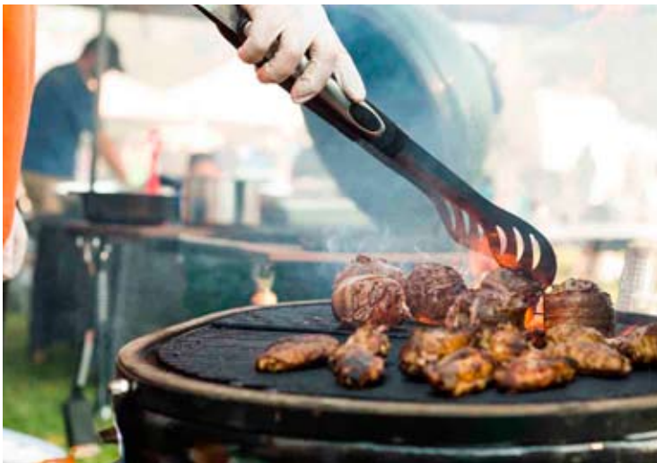
A GRILL TEAM COOKS A TASTY TREAT AT THE SMOKE ON THE LAKE BBQ FESTIVAL.