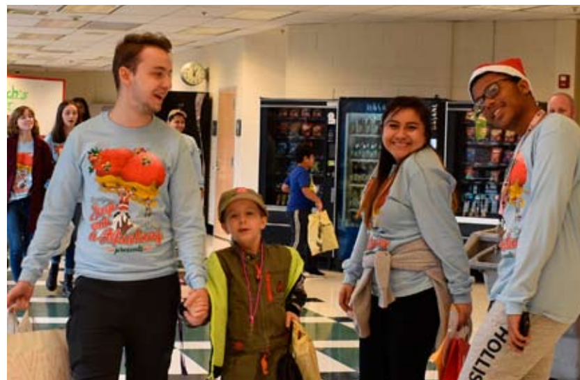
PICTURED: KMHS SHOPPERS RETURNING FROM A SUCCESSFUL TRIP.