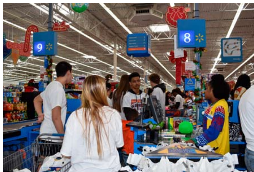
PICTURED: NCHS SHOPPERS CHECKING OUT AT WALMART.

Whenever an agency, organization or community member has called on her for support, she has responded quickly, effectively and calmly--a calm voice in the midst of chaos. She has been an advocate, protector, provider and cheerleader when her community has needed it most.